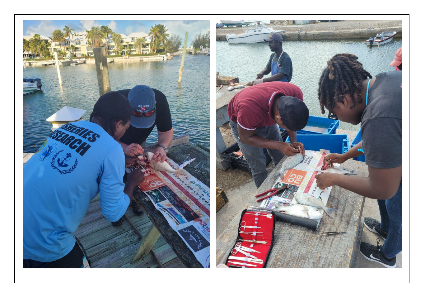
Figure 1: Project staff supervising and assisting with fisheries officer training